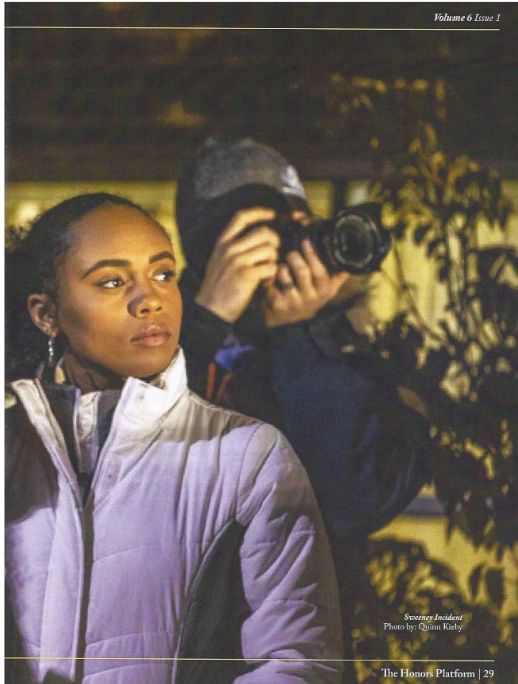
Sweeney Incident